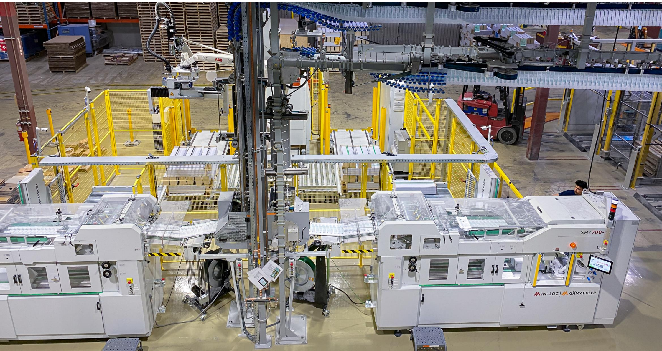
▲ Operator-friendly layout with two SH/700-IG log stackers side by side and a robot handling the logs from both stackers.