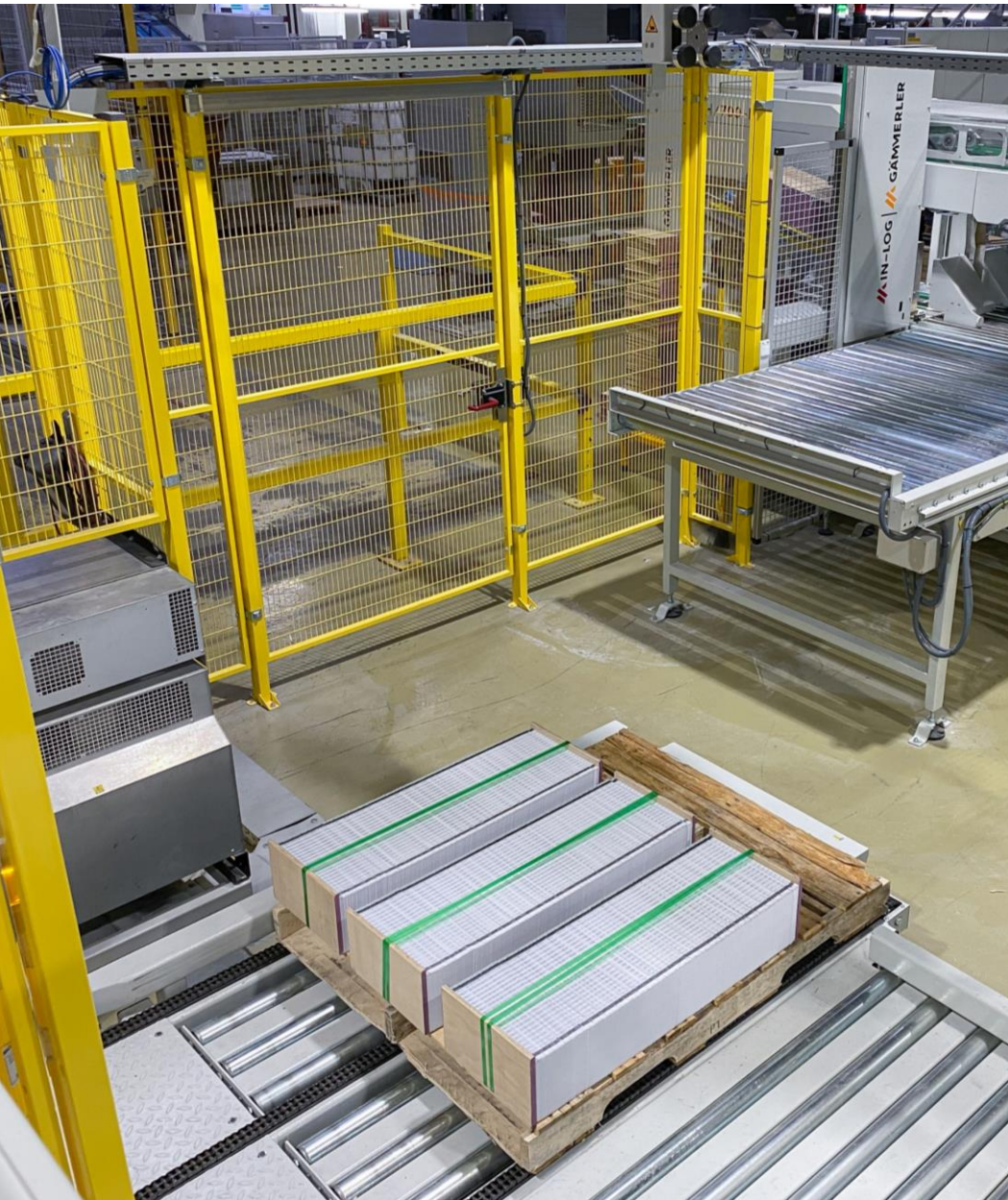
▲ Flexible palletizing patterns allow customized spacing between the logs for best pallet stability.