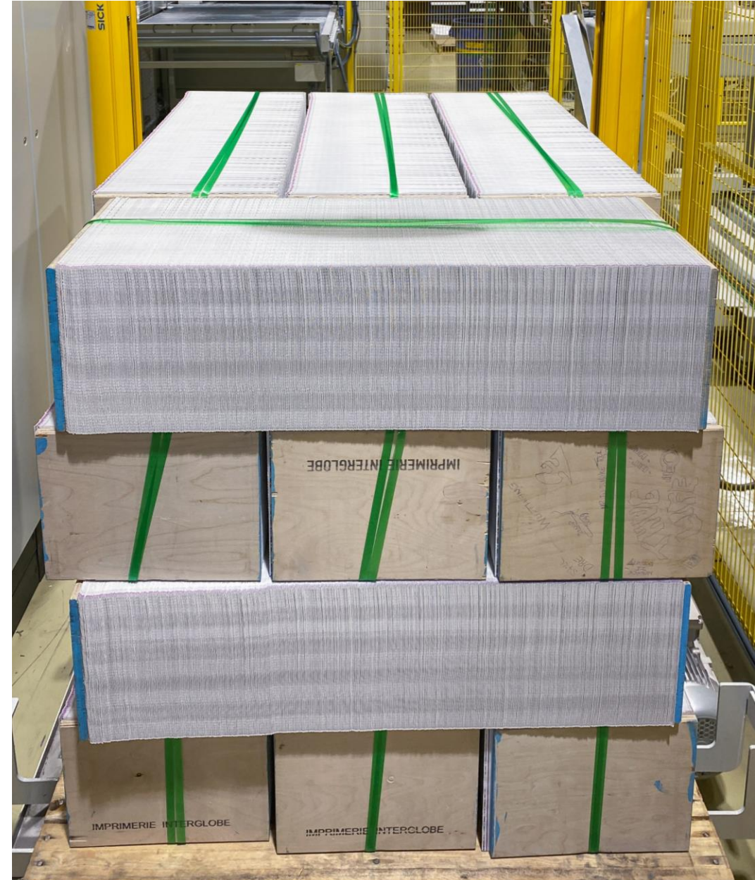
▲ Flexible palletizing patterns allow the variable palletizing of the logs onto the pallet.