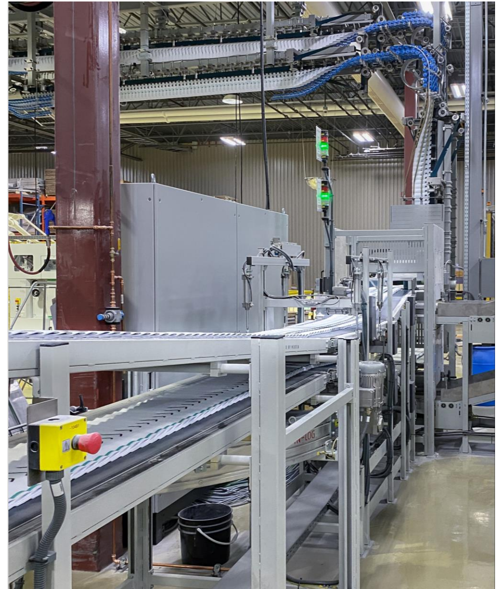
▲ The two floor conveyors transform into two overhead lines, each feeding a SH/700-IG log stacker.