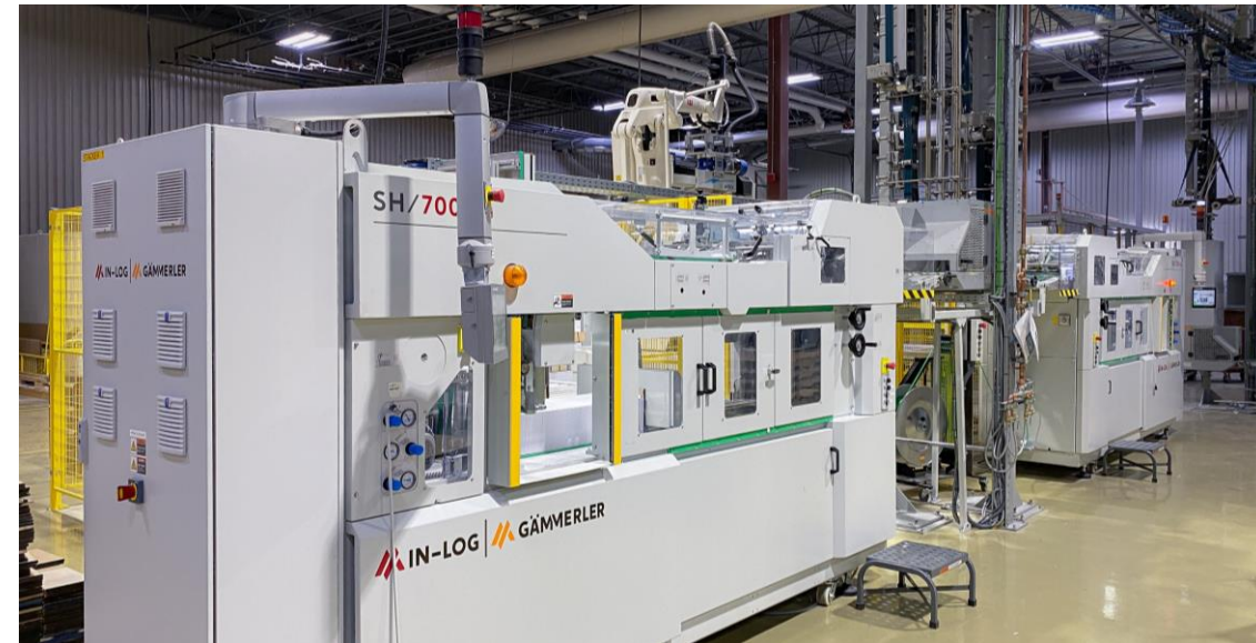
▲ The robot can place the logs side by side but also "criss-cross"