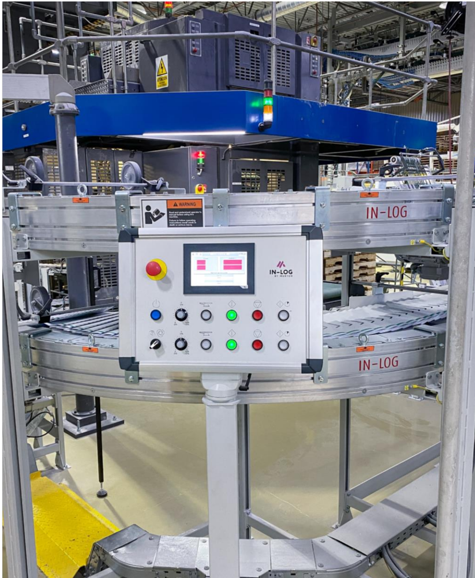
▲ Central HMI for the conveying line with floor conveyors and two overhead lines which keep the floor space free.